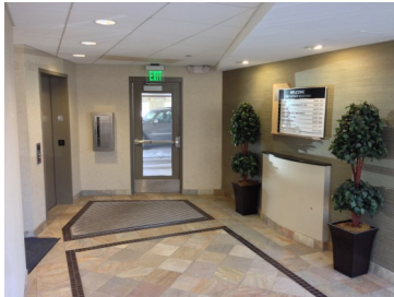
1st Floor Lobby