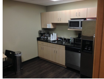
Common Break Room